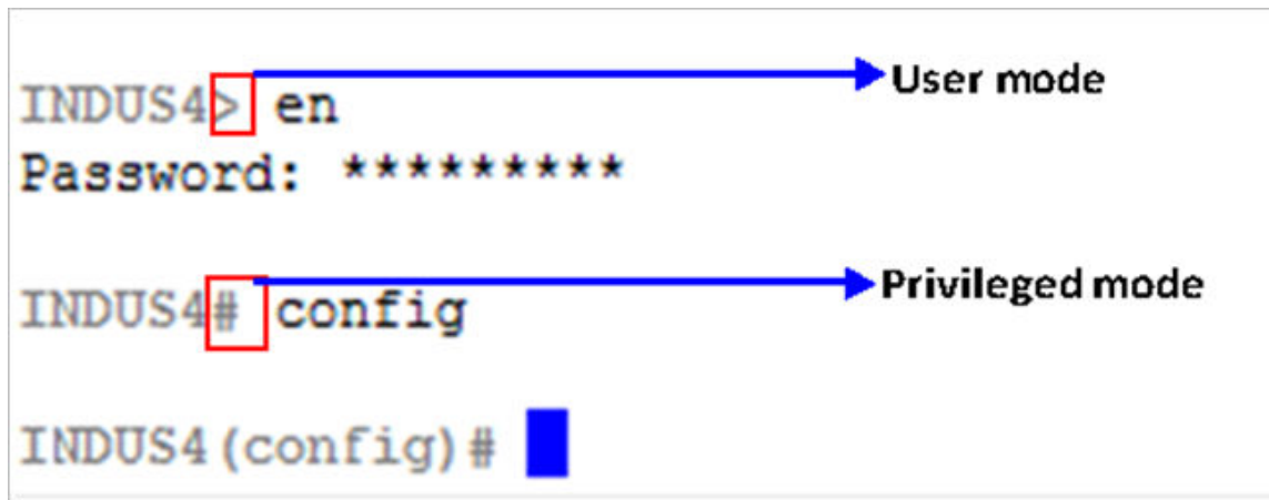
FIGURE 5 Changing to Privileged mode